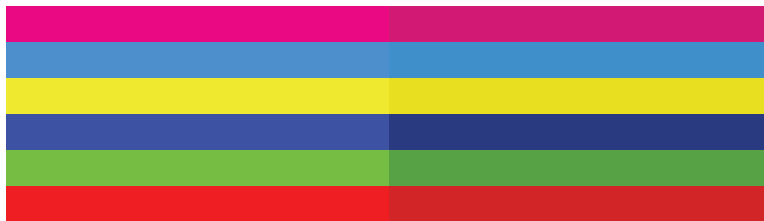
RGB color mode

Convert all your art files to CMYK color mode (or Grayscale if you are doing a Black/White layout). Files must be set up as CMYK for colors to print accurately.